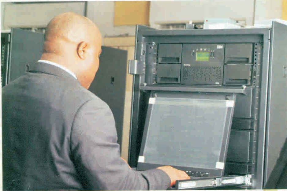
Server Room, CSCS Head Office