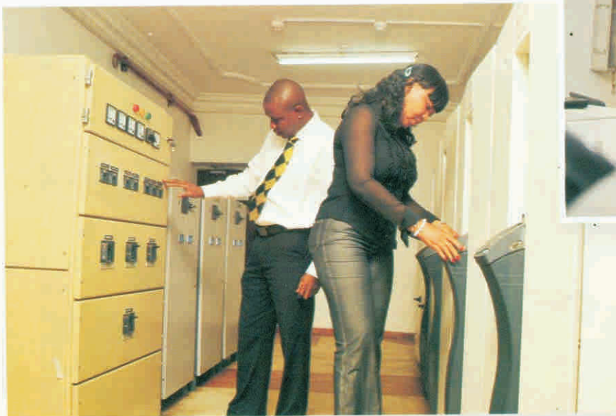
Facilities at CSCS Digital Centre, Parkview Estate, Ikoyi